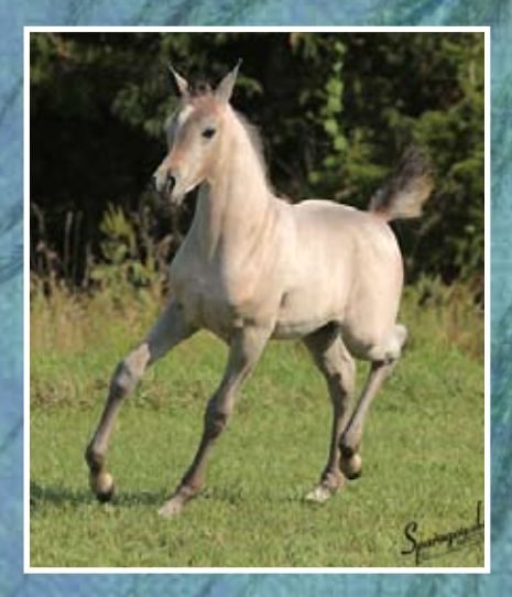
layout & design by www.evenstarenterprises.com | | visit www.albadia.com