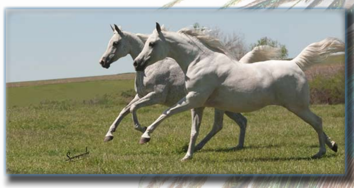
by Joe Ferriss

In life all things in balance and harmony end up being the things we value the most, whether a fine work of art such as a Rodin sculpture, or a perfect meal of the right balance of flavors, even the finest of automobiles which never seem to be out of style.